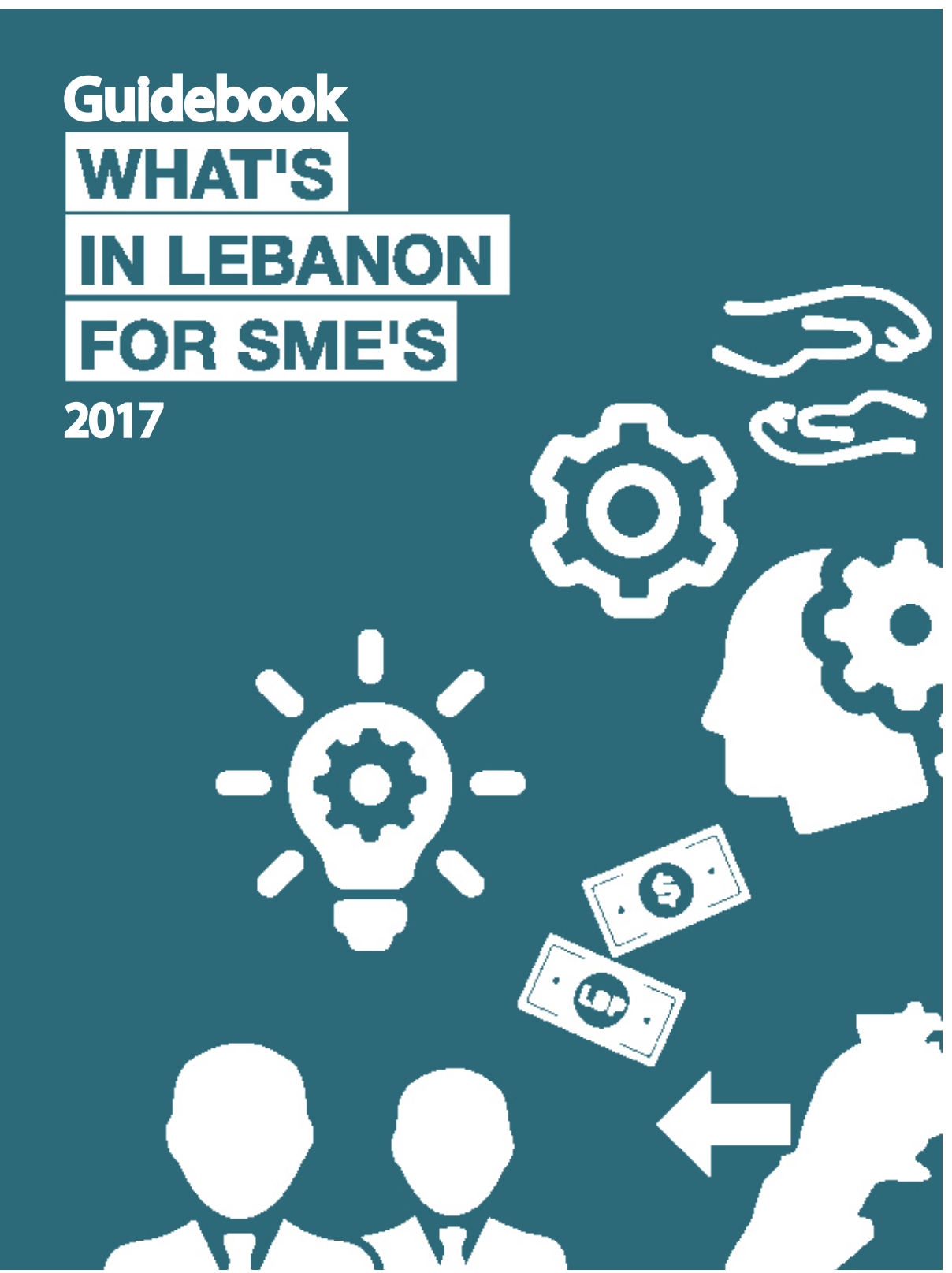
The material contained herein is provided for informational purposes only without any warranties with respect to the accuracy or completeness of the information. The Ministry of Economy and Trade expressly disclaims all liability for any actions taken or refrained from being taken in response to the information contained herein