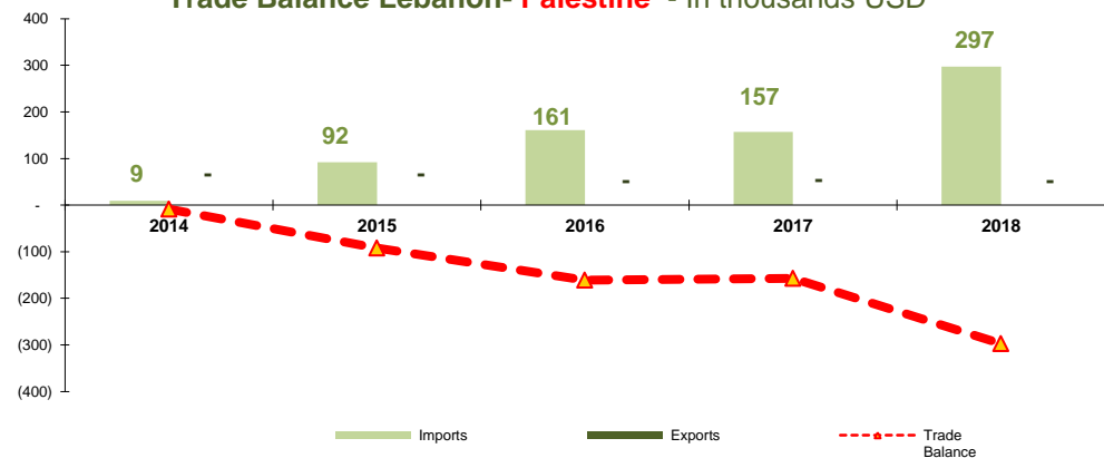
Trade Balance Lebanon- Palestine - In thousands USD